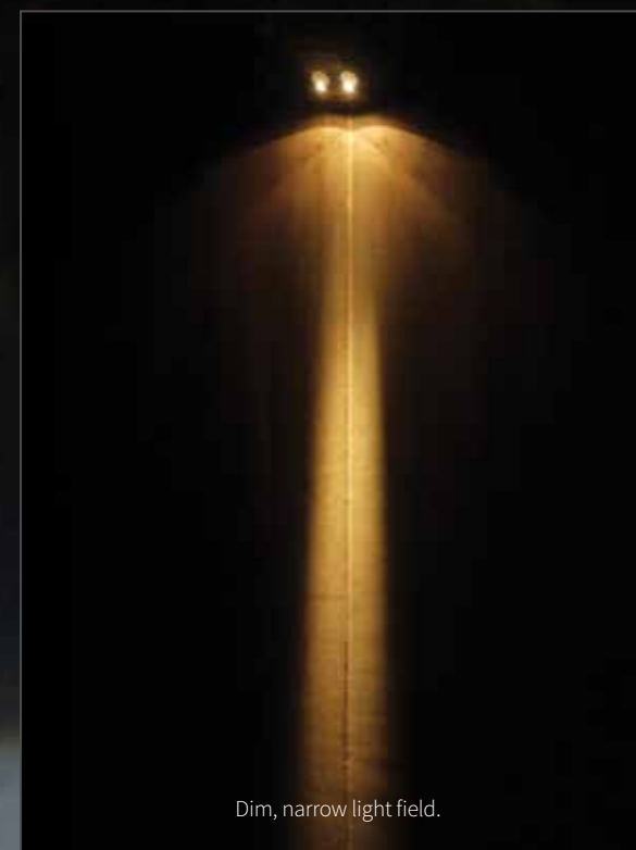
HALOGEN Old Yamaha Standard