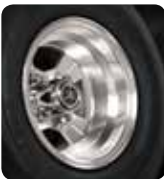
4 SPOKE ALLOY WHEEL AVAILABLE IN 10" & 12" SIZES