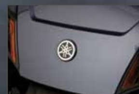
LED FRONT LOGO