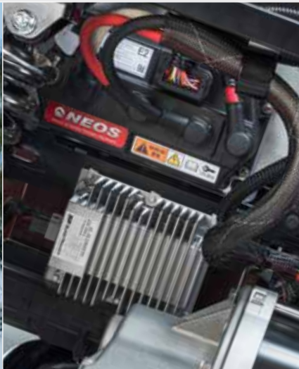
Toyota Industries-built motor control unit.