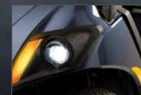
LED TURN SIGNALS